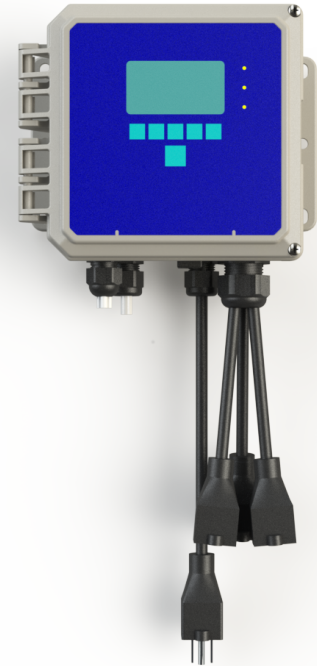
MX-W100 front view